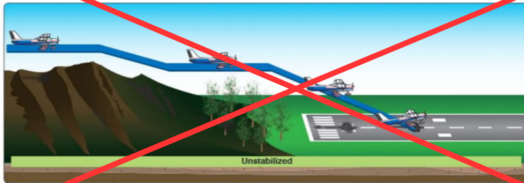
Figure 23. Unstabilized approach.